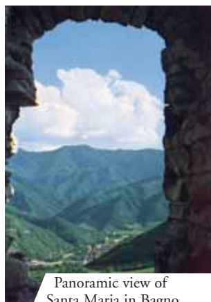
Panoramic view of Santa Maria in Bagno