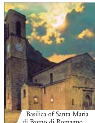
Basilica of Santa Maria di Bagno di Romagna