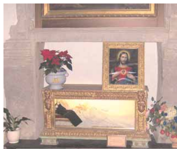
Chapel with the urn of Blessed Giovanna