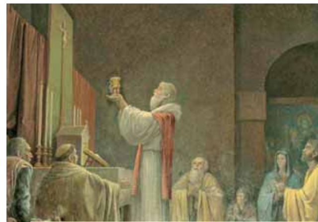
Picture that depicts the miracle present in the basilica