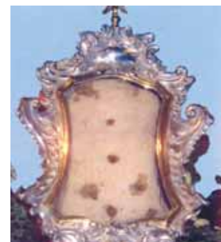
Relic of the Blood-stained corporal