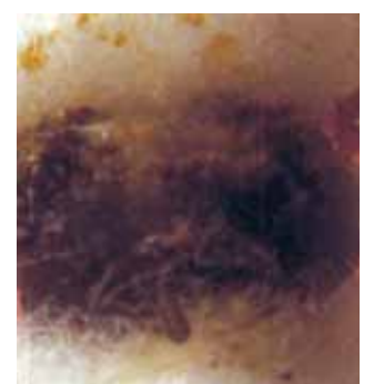
Detail of the reliquary