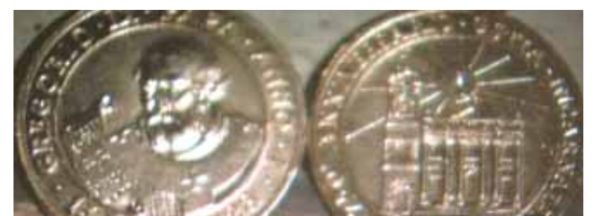
The 750th anniversary of the miracle was solemnly celebrated in 1978. For the occasion, a medal was coined which on front shows an image of Pope Gregory IX with the Bull and on back, the façade of the cathedral with the Host above