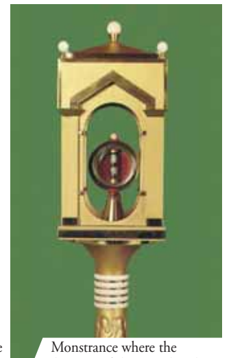
Monstrance where the reliquary of the miracle is kept