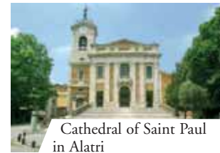
Cathedral of Saint Paul in Alatri