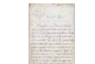
Letter of the rector of Saint Mary alle Terme, dated March 22, 1888, in which he gives thanks for the gift of part of the reliquary of the Incarnate Host conserved in Alatri