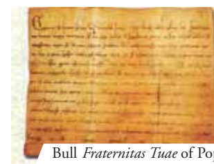
Bull Fraternitas Tuae of Pope Gregory IX