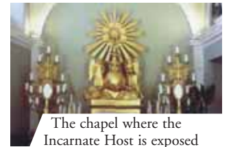
The chapel where the Incarnate Host is exposed