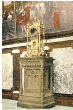
Relic of the miraculous Blood, St. Catherine's Church