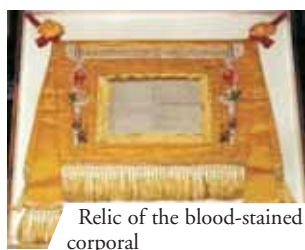
Relic of the blood-stained corporal