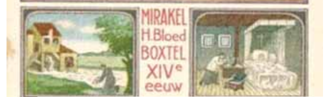
The Eucharistic miracle took place at St. Peter's Church in Boxtel