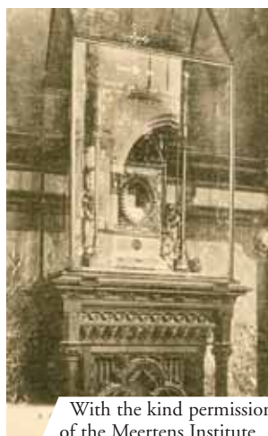
With the kind permission of the Meertens Institute