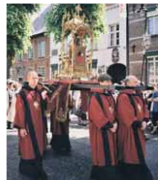
The relic being carried in procession