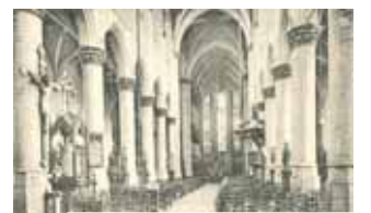
Interno della chiesa