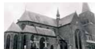
Il Miracolo Eucaristico si verificò nella chiesa di San Pietro a Boxtel