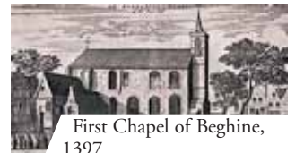
First Chapel of Beghine, 1397