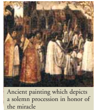
Ancient painting which depicts a solemn procession in honor of the miracle