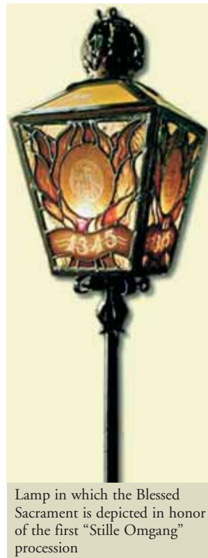
Lamp in which the Blessed Sacrament is depicted in honor of the first "Stille Omgang" procession