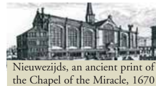
Nieuwezijds, an ancient print of the Chapel of the Miracle, 1670