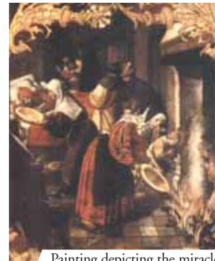
Painting depicting the miracle