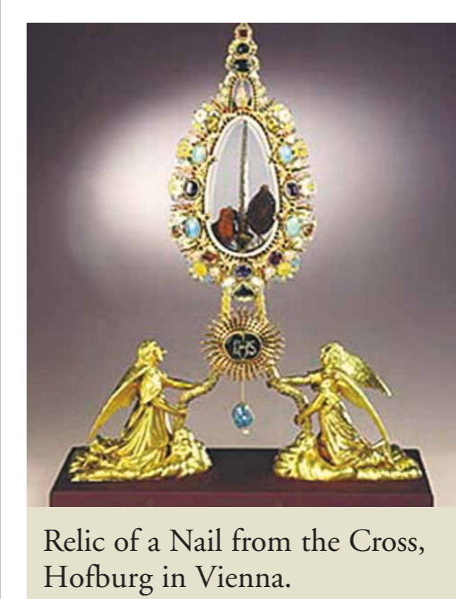
Relic of a Nail from the Cross, Hofburg in Vienna.