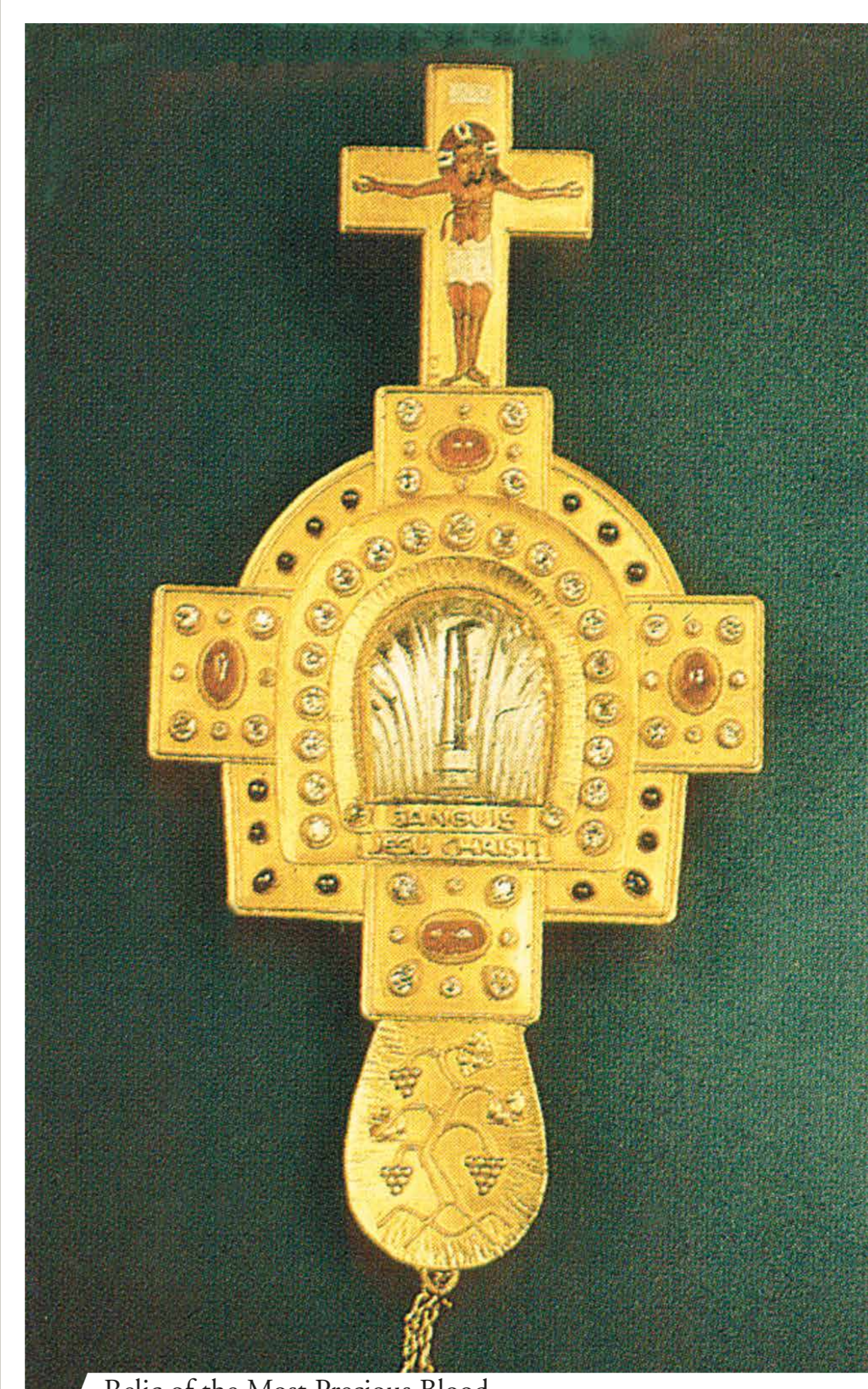
Relic of the Most Precious Blood