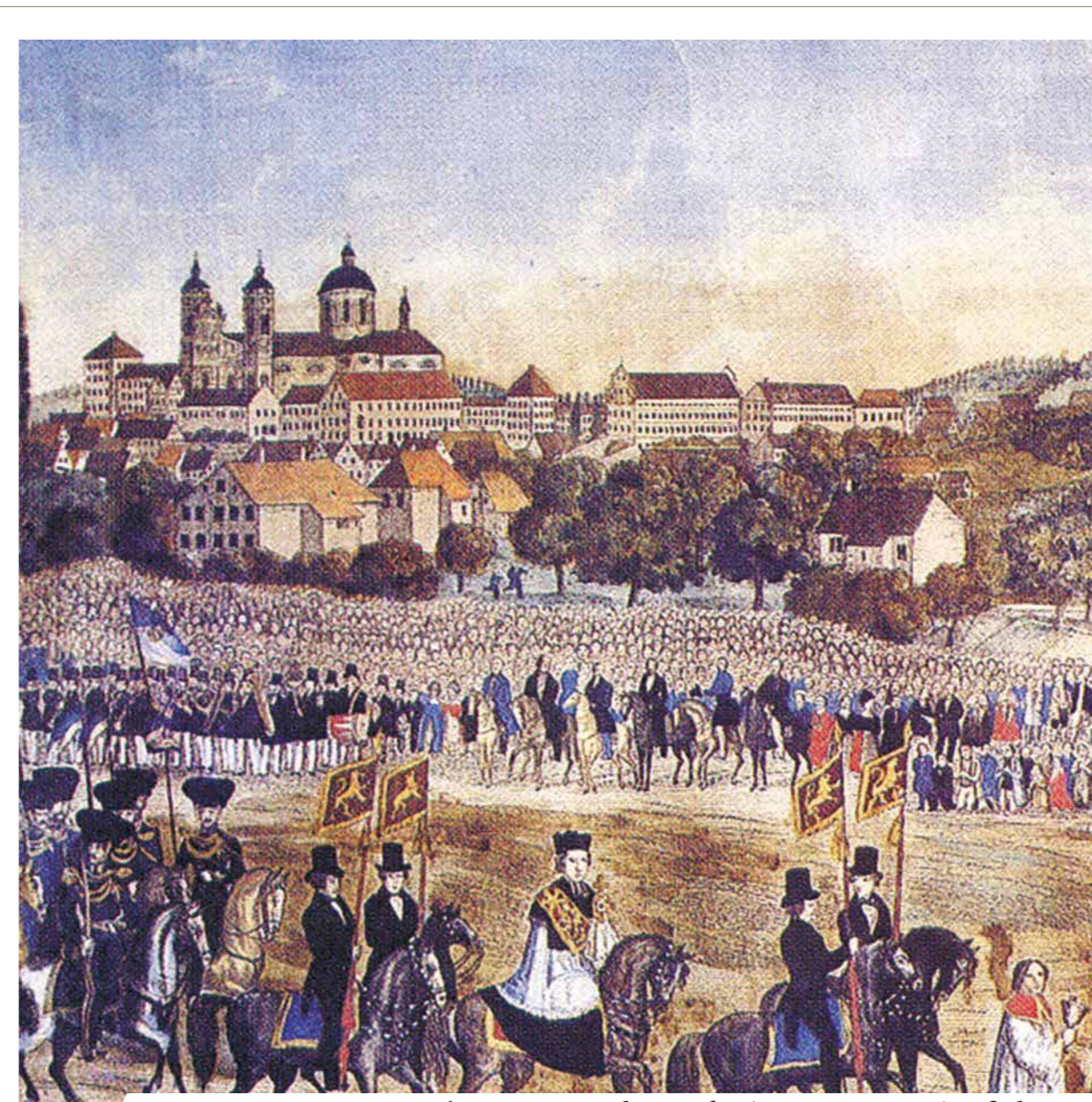
Antique painting depicting The Ride (or Procession) of the Most Precious Blood held in Weingarten