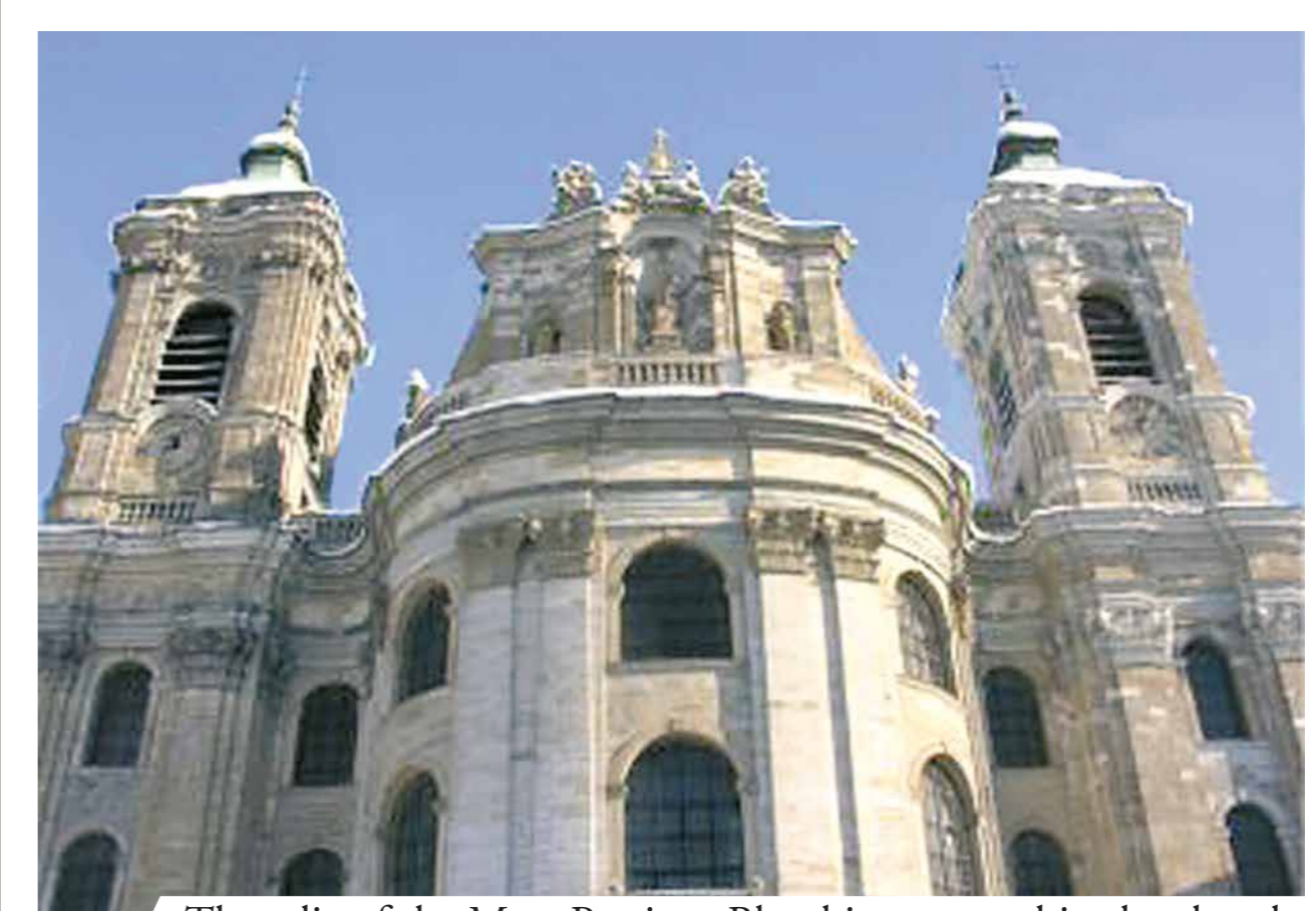
The relic of the Most Precious Blood is preserved in the church of Saint Martin in Weingarten