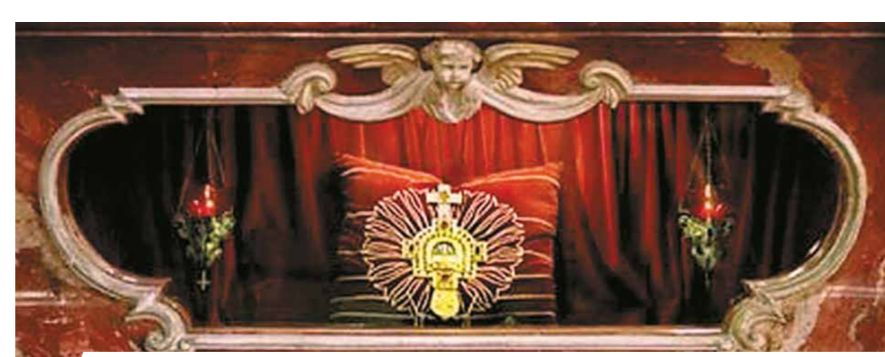
Urn containing the sacred relic

For more than 900 years it has been possible to venerate the relic of a portion of the Most Precious Blood of Jesus at the Benedictine Monastery at Weingarten. According to many historians, the soldier Longinus had carried the relic of the Most Precious Blood of Christ to Mantua. Later the Precious Blood was divided into several portions and given to various rulers of the era, the most famous of whom was Charlemagne, and to different popes.