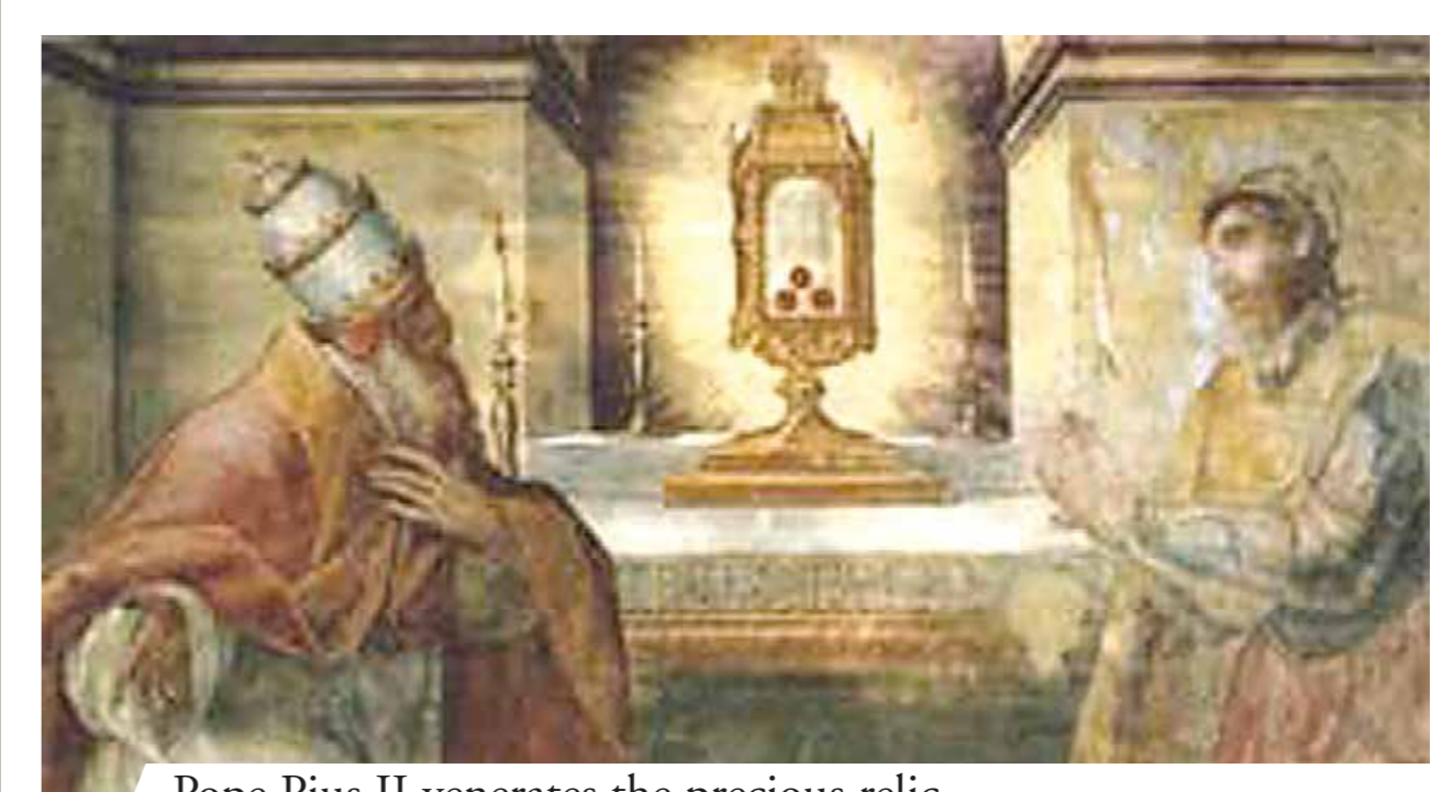
Pope Pius II venerates the precious relic

Every year a ceremony known as The Ride (or Procession) of the Blood, in honor of the relic, was organized at Weingarten. It was a parade in which nearly 3,000 horses, ridden by representatives of the individual parishes and by the clergy of the individual churches, participated.