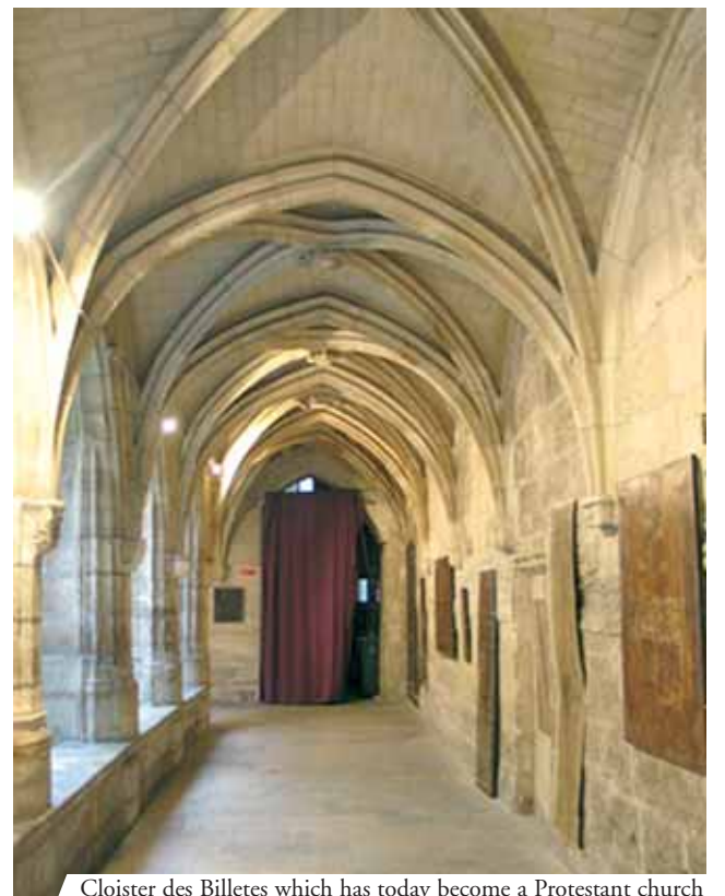
Cloister des Billetes which has today become a Protestant church