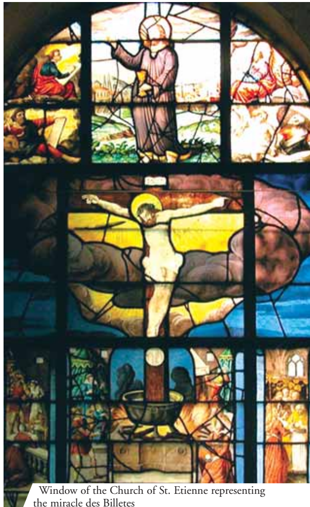
Window of the Church of St. Etienne representing the miracle des Billetes

During Easter of 1290 a non-believer who harbored animosity toward the Faith and did not believe in the Real Presence of Christ in the Eucharist was able to gain possession of a consecrated Host with the intent to desecrate it. He stabbed the Host and threw it into boiling water. The Host came out of the water by itself right in front of the man who was distressed by this and so put the Host in the basin of a pious woman. The woman immediately brought the Host to her pastor.