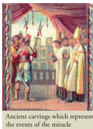
Ancient carvings which represent the events of the miracle