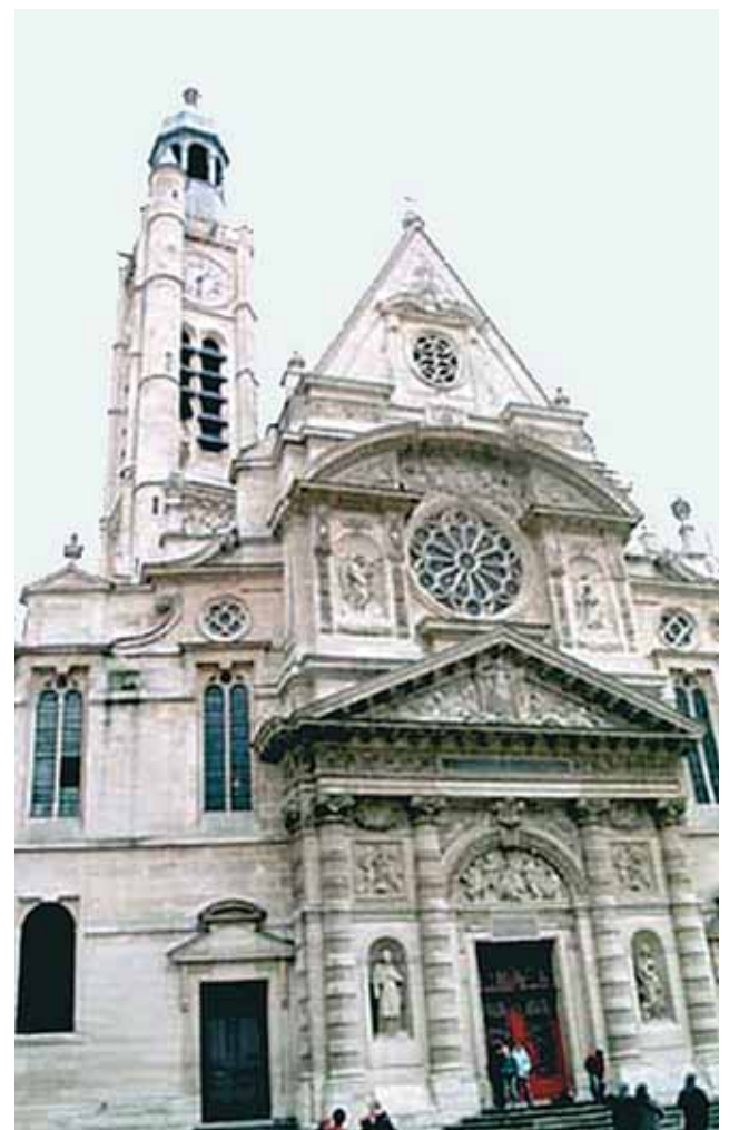
The Church of St. Etienne du Mont