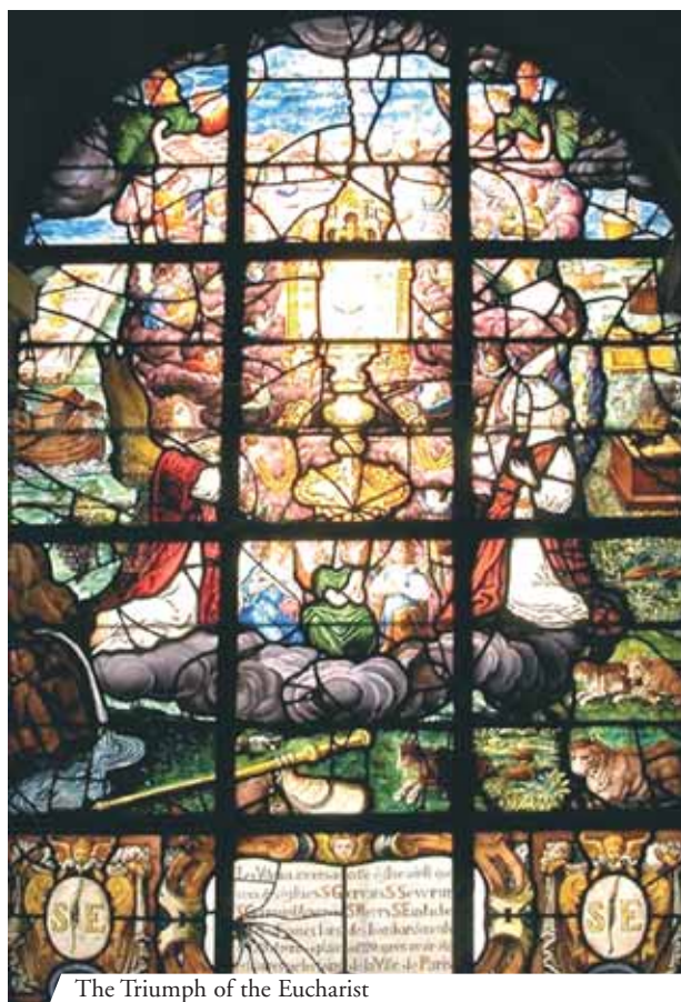
The Triumph of the Eucharist