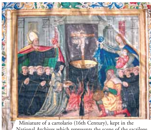
Miniature of a cartolario (16th Century), kept in the National Archives which represents the scene of the sacrilege