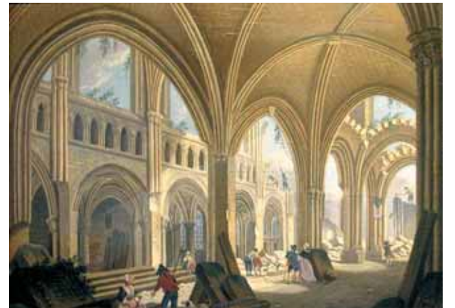
Demolition of the Church of Saint-Jean-en-Grève. Pierre-Antoine Demachy (1797)