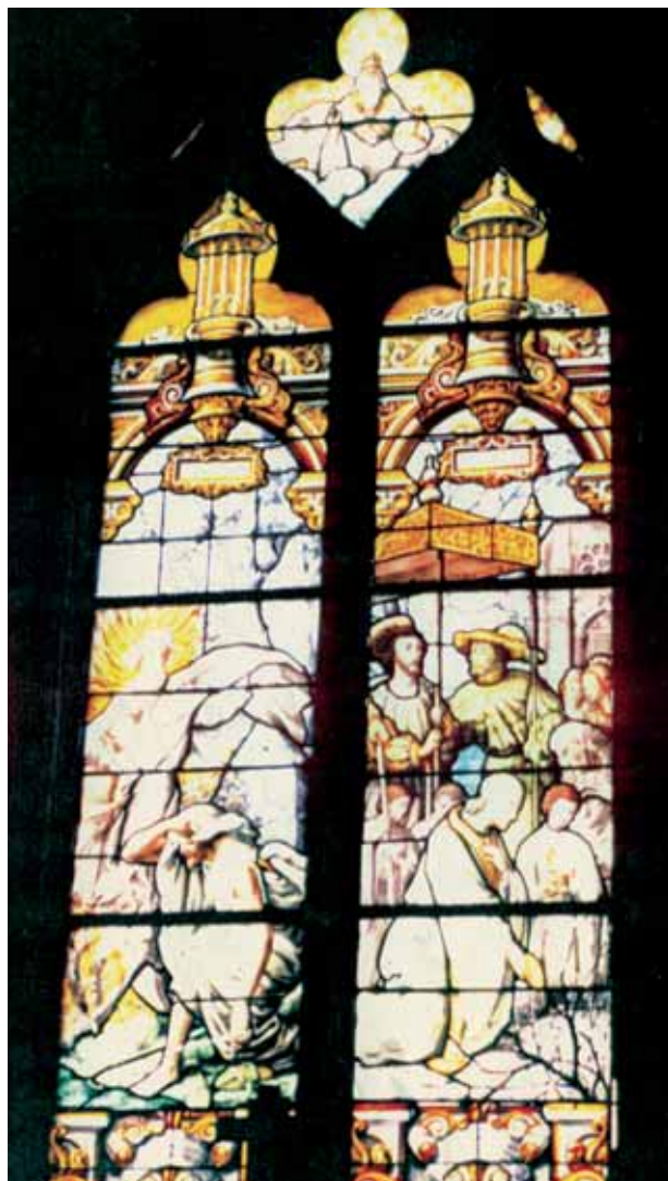
Window depicting the miracle

In 1533, some thieves stole a ciborium containing some consecrated Hosts from a church. The thieves then discarded the Hosts in a field. Unfortunately there was a strong snow storm; however, the following day the Hosts were recovered and miraculously were found to be in perfect condition. The numerous healings and the tremendous popular devotion that followed the miracle were not sufficient to protect the Hosts which were destroyed by some seeking to profane them.