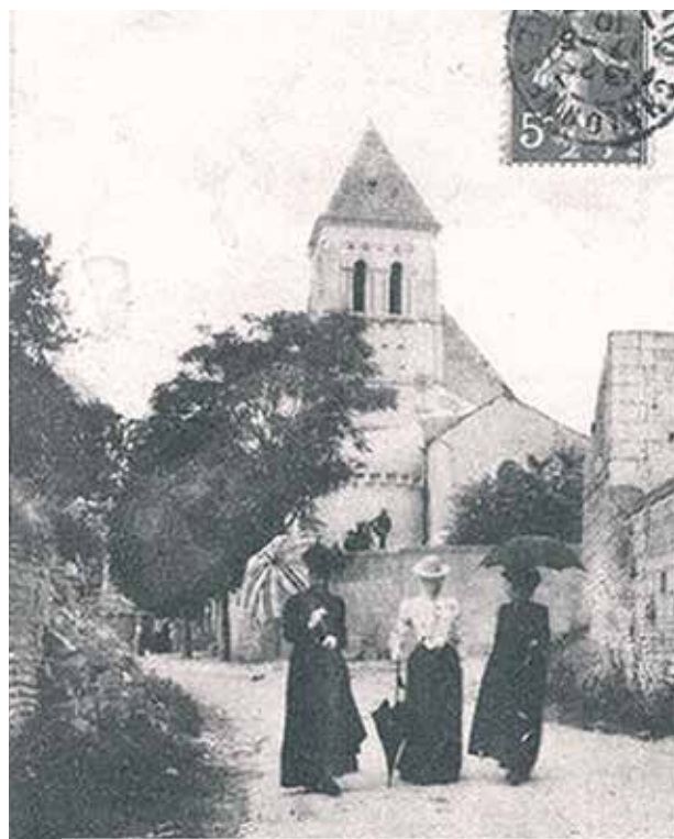
Parish church of Les Ulmes