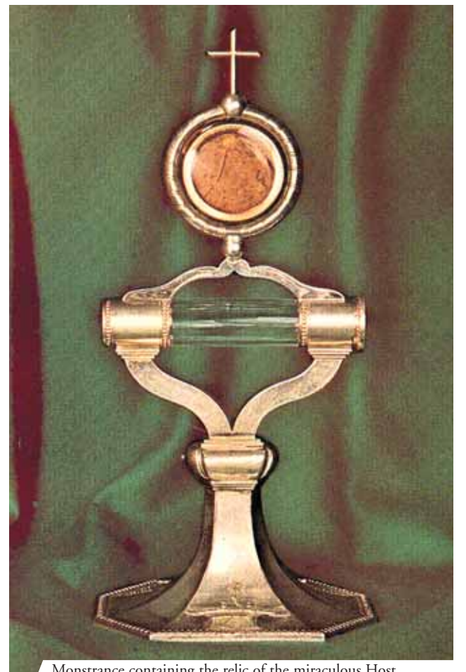
Monstrance containing the relic of the miraculous Host

In the 17th century, Protestantism and Calvinism spread quickly in France by means of the many material benefits conceded by the new religions to the members of the nobility and the clergy coming from the Catholic Church. This placed at risk the faith of many and created many uncertainties, even in the monasteries. In the city of Favenerney there was a Benedictine Abbey whose monks had departed a great deal from the rule of their founder. They had only in high-esteem the devotion to the Lady of Notre-Dame la Blanche, known in all the area for its many miracles. Through her intercession many miracles had in fact been verified, among which was even the returning to life of two infants who were not yet baptized. In 1608, on the Vigil of the Feast of Pentecost, the monks decided to prepare an altar for the exposition and adoration of the Blessed Sacrament. The lunette of the monstrance was very large, and