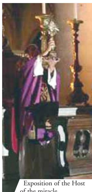
Exposition of the Host of the miracle