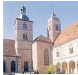
Minor Basilica, Favenerney