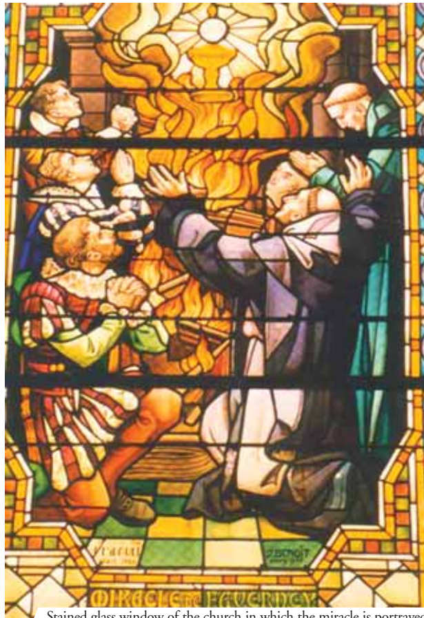
Stained glass window of the church in which the miracle is portrayed

On the Vigil of the Feast of Pentecost, the monks of Favenerney decided to expose the Blessed Sacrament for public adoration. During the night, a fire flared up which destroyed the altar and the sacred furnishings, but not the monstrance containing the Sacred Host. The monstrance was retrieved after a few days while it was suspended in the air perfectly intact. The miraculous Host is still kept today and many are the pilgrims who every year hasten to venerate the miracle.