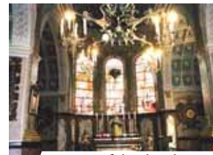
Interior of the church