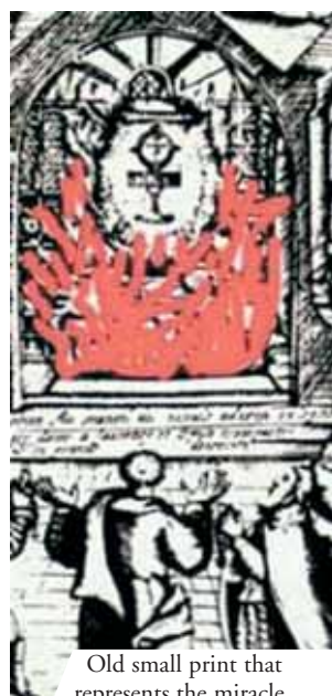
Old small print that represents the miracle