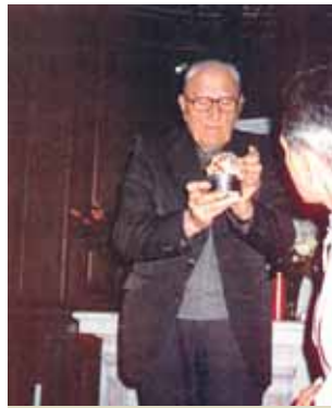
Year 1975. The Pastor of the Church of St. Peter shows the Host of 1254.

In the Eucharistic Miracle of Douai, a consecrated Host was unintentionally dropped to the ground while a priest was distributing Communion to the faithful. Immediately he bent down to pick it up, but it lifted itself up in flight and went to place itself on the purificator. In its place, a little later, a wonderful child appeared, who all the faithful and religious present in the celebration could contemplate. Although more than 800 years have elapsed, even today it is still possible to admire the Host of the miracle. All Thursdays of the month, in the Church of Saint Peter of Douai, many faithful gather in prayer before the miraculous Host.