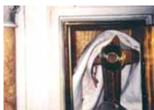
Tabernacle where the Host of the miracle is kept