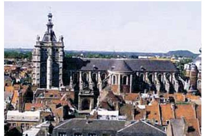
External façade of the Church of St. Peter in Douai