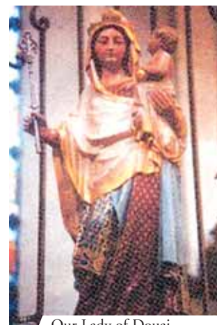
Our Lady of Douai