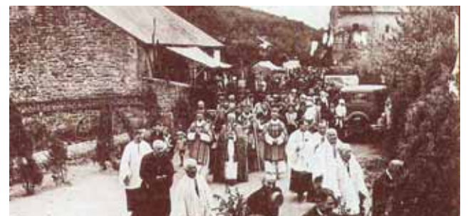
Procession in honor of the Miracle