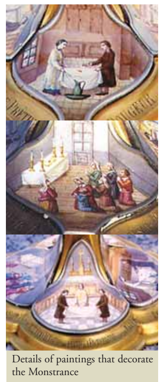
Details of paintings that decorate the Monstrance