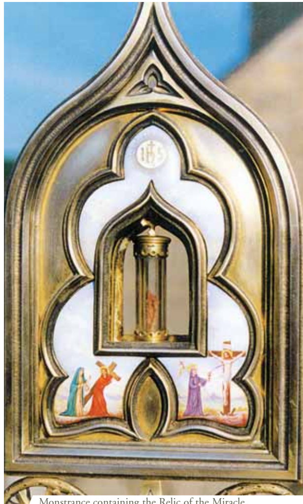
Monstrance containing the Relic of the Miracle

The Eucharistic Miracle of Blanot took place during the Easter Mass of 1331. During Communion, a Host fell to a cloth that was held below the communicant's mouth. The priest tried to pick it up, but it was not possible. The Host had transformed into Blood, resulting in a stain – the same size as the Host – on the cloth. That cloth is preserved today in the village of Blanot.