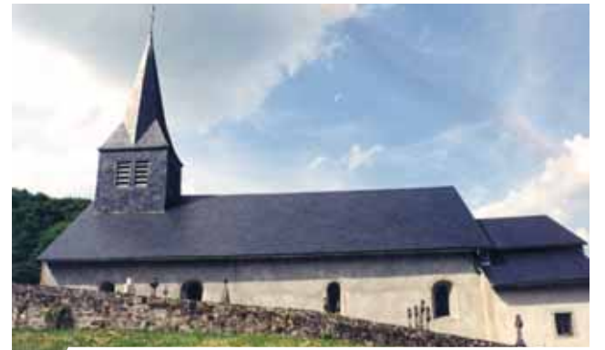
Parish of Blanot