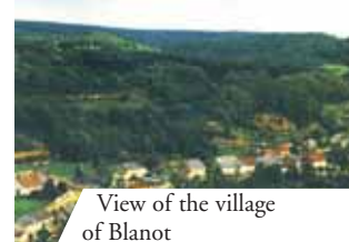
View of the village of Blanot