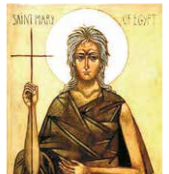
Monastery of St. Paul