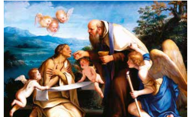
Marcantonio Franceschini, Last Communion of St. Mary of Egypt (1690)