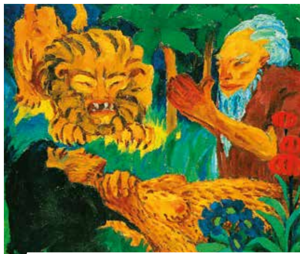
Emile Nolde, Death in the Desert