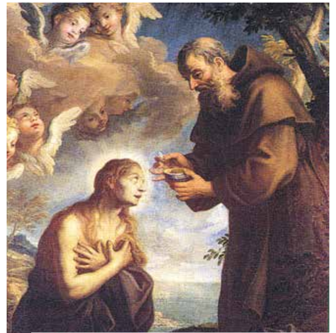
St. Mary of Egypt. Diocesan Museum of Milan

We are told that when St. Mary was 12 years of age she left her parents and went to Alexandria. There she led a very dissolute life for 16 years. One day she came upon a ship about to set sail with different groups of passengers. She inquired who they might be and where they were going. She was told they were pilgrims sailing toward Jerusalem for the feast of the Exaltation of the Cross. She decided to join them. When on the feast day she tried to enter the church, she was seized by a mysterious force. Fearfully she raised her eyes to an image of the Holy Virgin and was overcome with a deep sorrow for the sinful life she had led until that day. Only then was she able to make her way into the church and worship the True Cross.