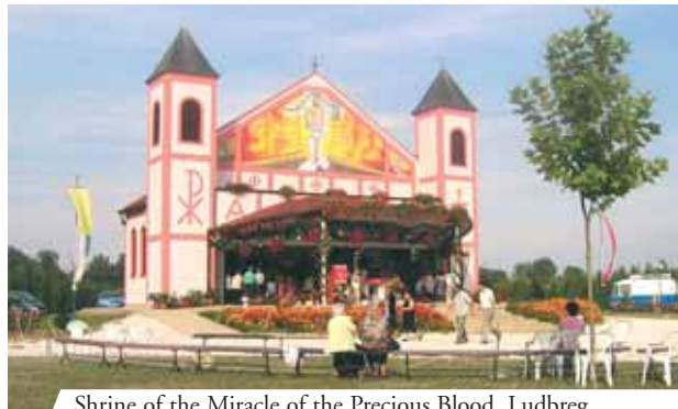
Shrine of the Miracle of the Precious Blood, Ludbreg

The relic of the Blood has remained perfectly intact and is kept in a precious monstrance made at the request of Countess Eleonora Batthyany-Strattman in 1721.