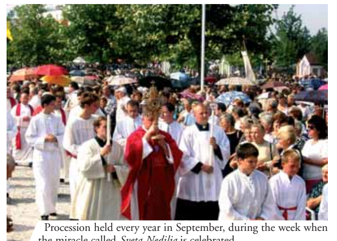
Procession held every year in September, during the week when the miracle called Sveta Nedilja is celebrated