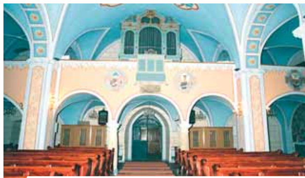
Interior of the shrine