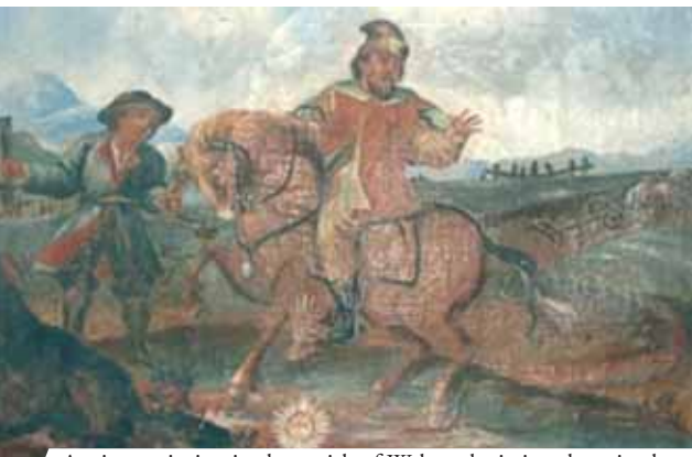
Ancient painting in the parish of Welten depicting the miracle