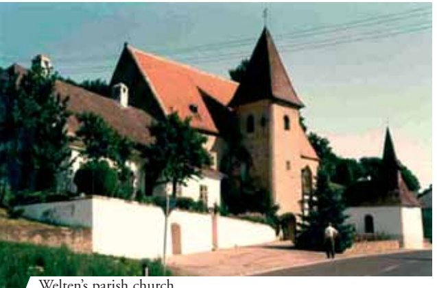
Welten's parish church