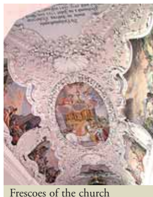
Frescoes of the church depicting the miracle