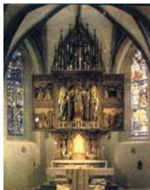
Altar of the miracle