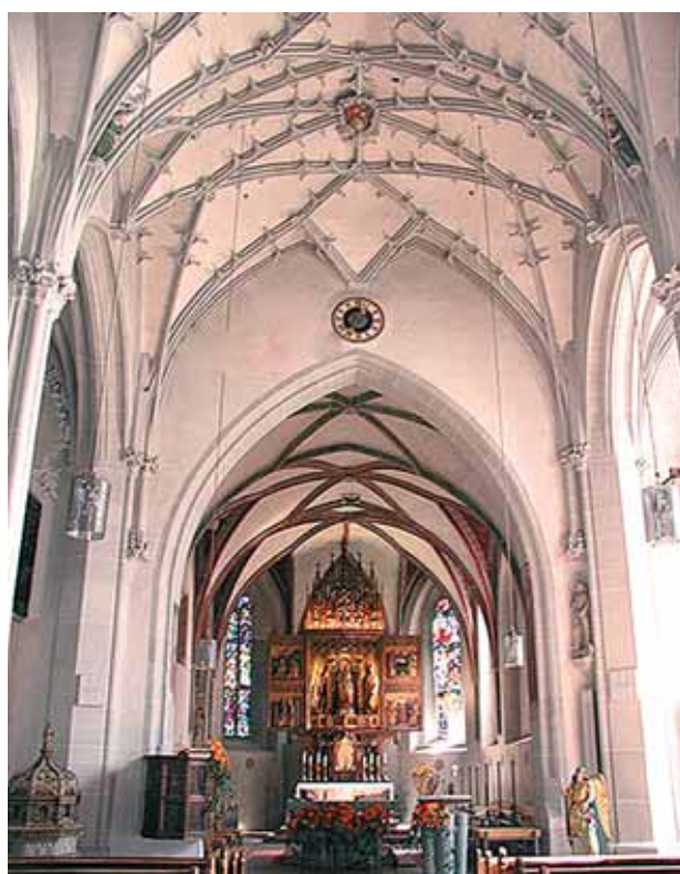
Main altar of the Church of St. Oswald, Seefeld