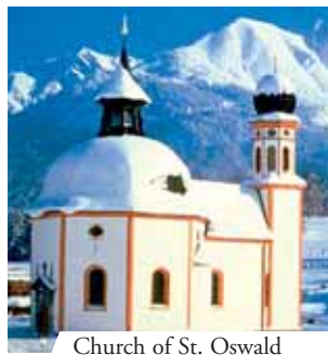
Church of St. Oswald