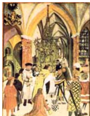
Ancient painting of the miracle