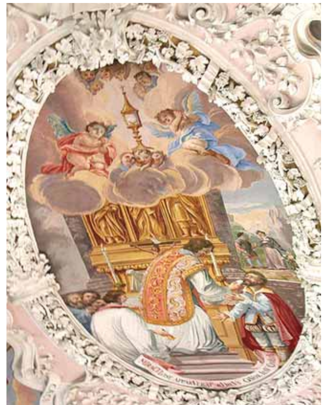
Miracle of Seefeld. Detail of the ceiling