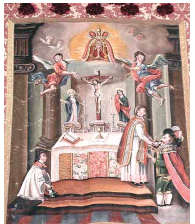
Banner in the Church of St. Oswald depicting the scene of the miracle