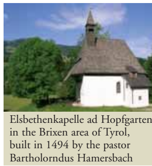
Elsbethenkapelle ad Hopfgarten in the Brixen area of Tyrol, built in 1494 by the pastor Bartholorndus Hamersbach