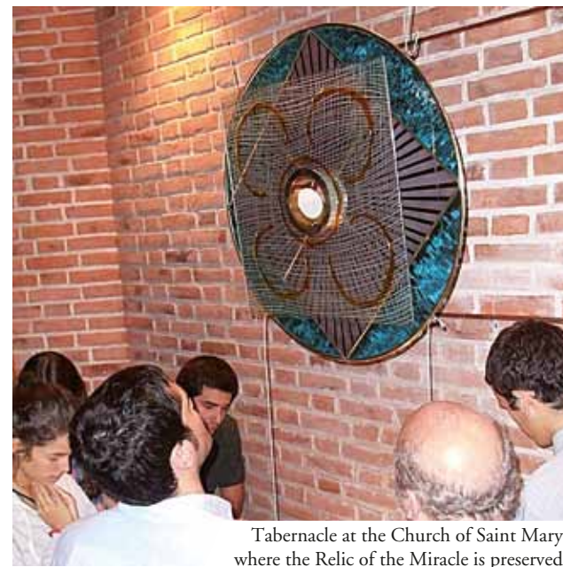
Tabernacle at the Church of Saint Mary where the Relic of the Miracle is preserved