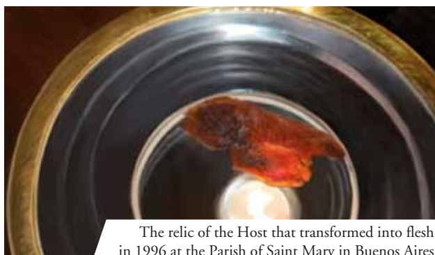
The relic of the Host that transformed into flesh in 1996 at the Parish of Saint Mary in Buenos Aires